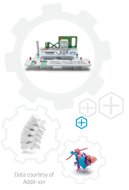
Data courtesy of Phoenix Children's Hospital; Heart of Jemma